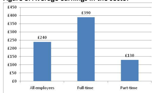
Figure 8: Average earnings in the sector